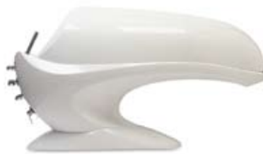
Time Thermal Capsules 12-13