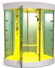
Showering Systems 22-25