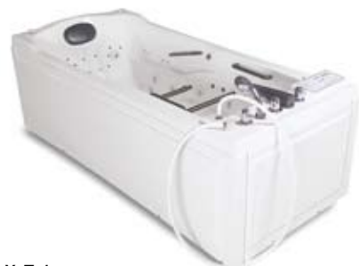
X-Tub Inverter driven, 9 treatment programmes, larger bathing area