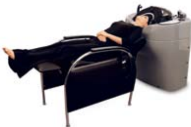
Suzi Head Hydrotherapy 28-29