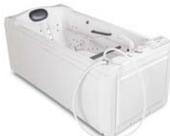
A-Tub inverter driven, 9 treatment programmes