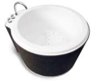
Geisha Tubs 8-9