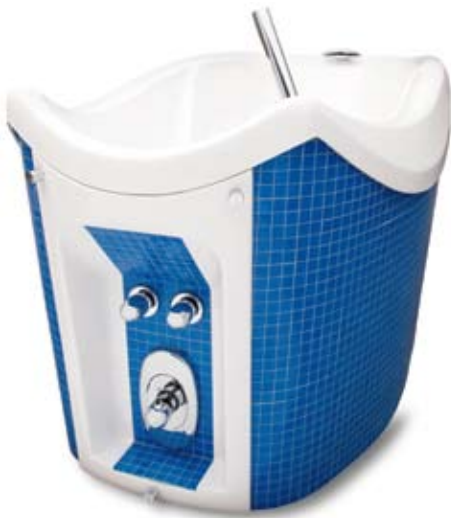
Separate hair /scalp basin