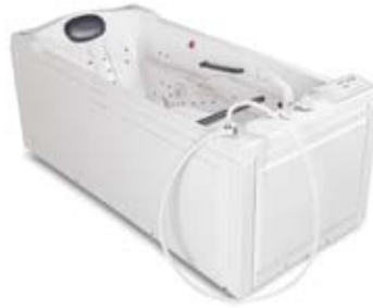
Hydrotone Tubs L, A and X 7