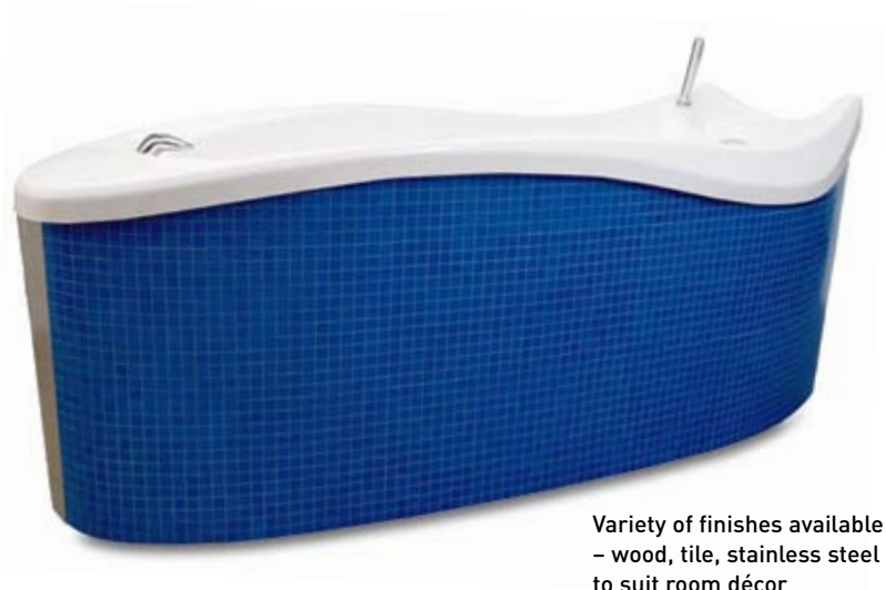
Variety of finishes available – wood, tile, stainless steel to suit room décor

An air-injected hydromassage system provides a vigorous, stimulating hydromassage and HydroColor lighting creates a relaxing mood for bathing experience.