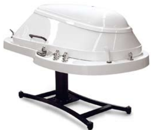
Hydrotone Thermal-M with floor stand