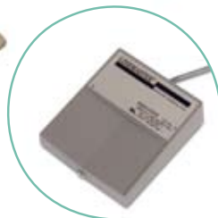
Convenient foot control