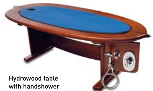
Hydrowood table with handshower

However, something you might not have expected is our unique hand crafted wood table. The Australian Western red Jarrah wood is dried and then carved to the shape of a mangrove leaf, it is then appropriately treated and sealed for wet room use.