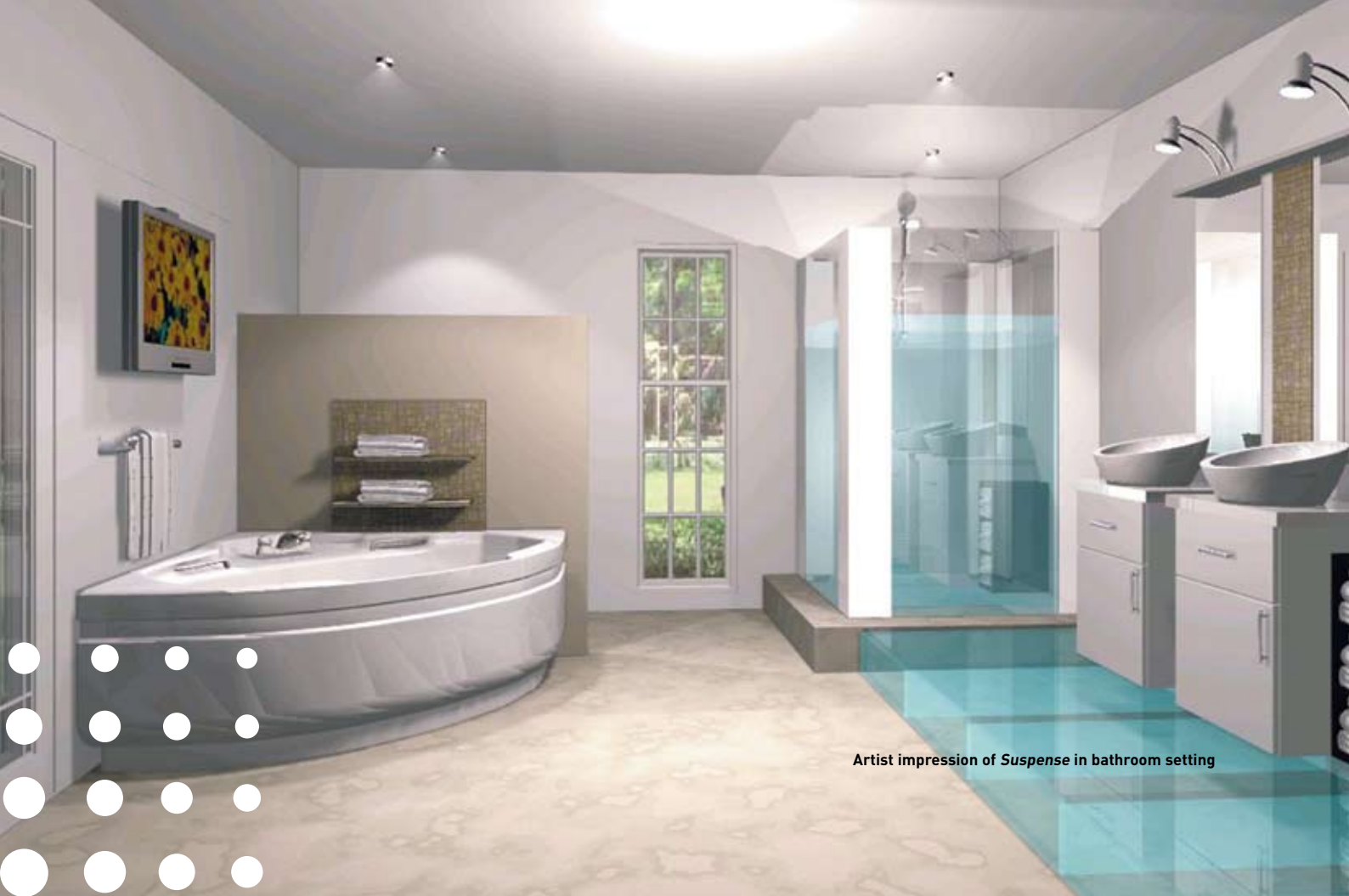
Artist impression of Suspense in bathroom setting