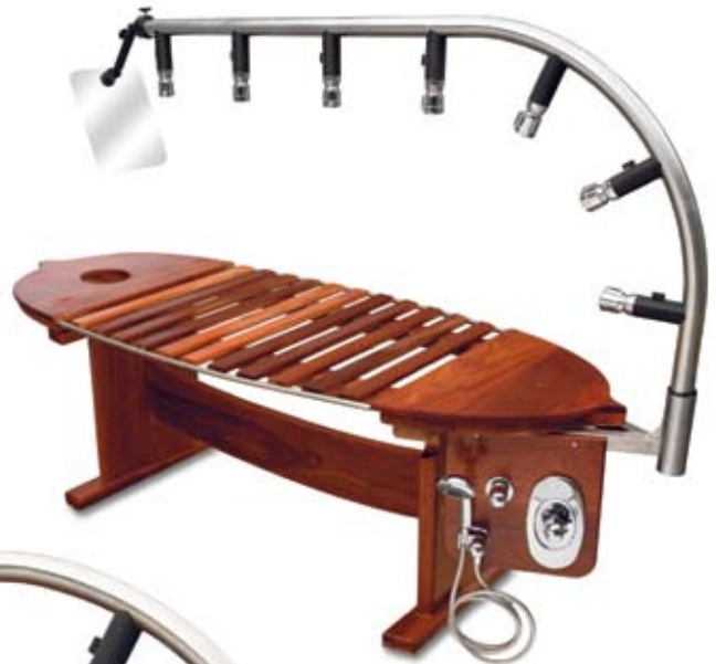
Hydrowood -7 Deck