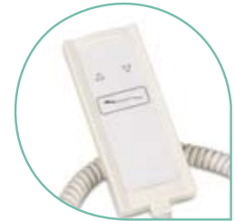
Convenient hand control