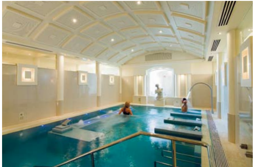
Custom hydrotherapy experience pools and showers

HydroCo are able to provide real information at the early stages of any development – including equipment