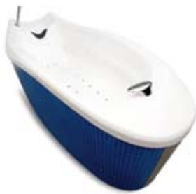
V-Tub Hydromassage Tub 10-11