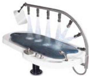
Vichy Showers 16-21