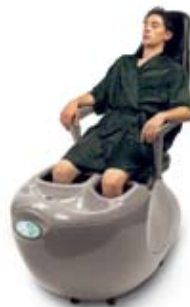
beyond Lower Leg Hydrotherapy 30-31