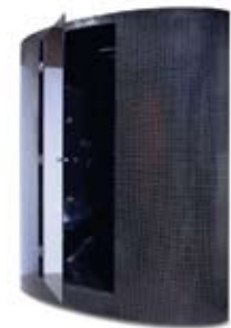
Lusar Thermal Room 26-27