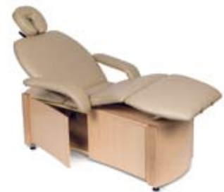
Treatment Tables 32-33