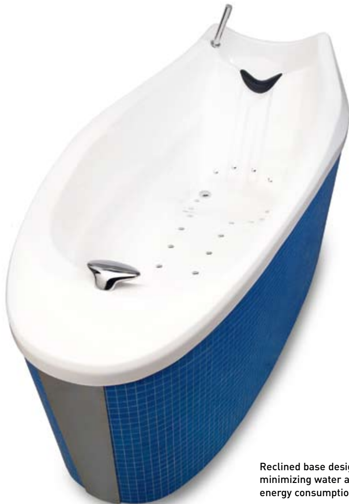
Reclined base design minimizing water and energy consumption