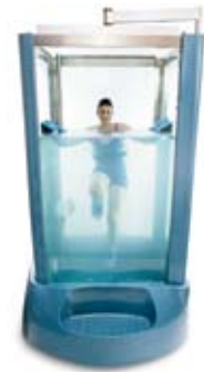
Suspense Aquatic Center 14-15