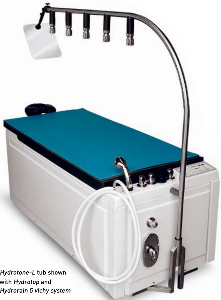
Hydrotone-L tub shown with Hydrotop and Hydrorain 5 vichy system

Maximize the use of a wet room by the addition of the Hydrotop Wet/Dry Table and the Hydrorain-5 Vichy System to the Hydrotone Tub. Perform tub, wraps, vichy and massage treatments in one room. The Hydrorain 5 incorporates individual flow control valves on each shower head so that water flow can be managed and saved. The Hydrotop is a two piece unit and easy to manoeuvre.