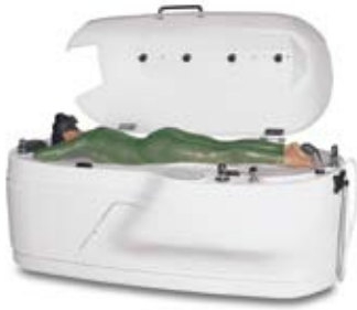
Hydrotone Thermal Capsules 4-6