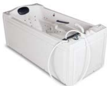
L-Tub 6 treatment programmes