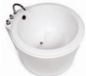
Gloss surround (standard)