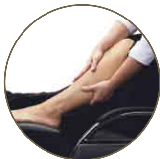
... and lower legs.