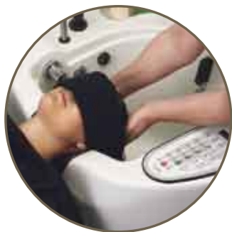
Massage in a treatment-pack during aromasteam operation.